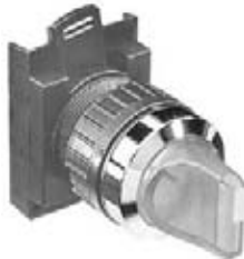
3 Position selection switch